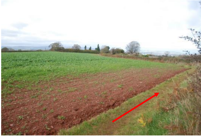
Turn right into the field and follow the hedge to the far side