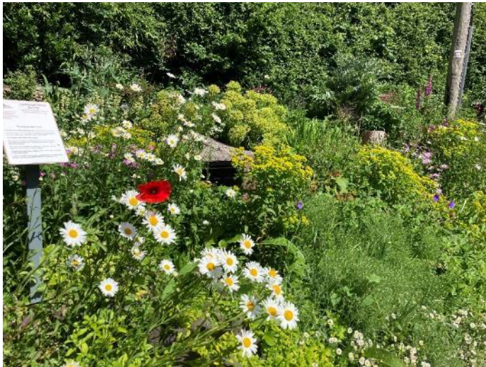
6 The Well