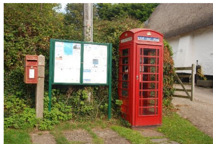
7 Grade II listed phone box