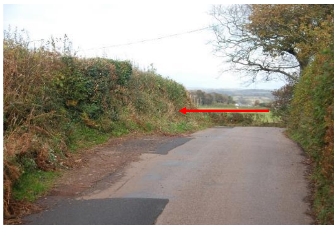
3 14 Acre Permissive Path starts just before St Marychurch Road