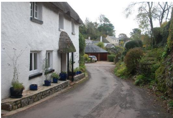
5 Approaching the left turn on to Under Way