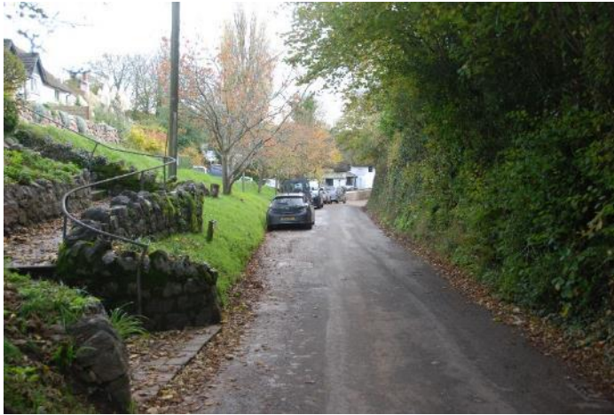
Back to the Linny