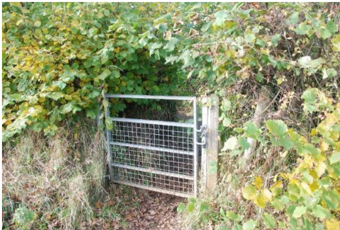
4 Kissing gate on to Blackenway Lane