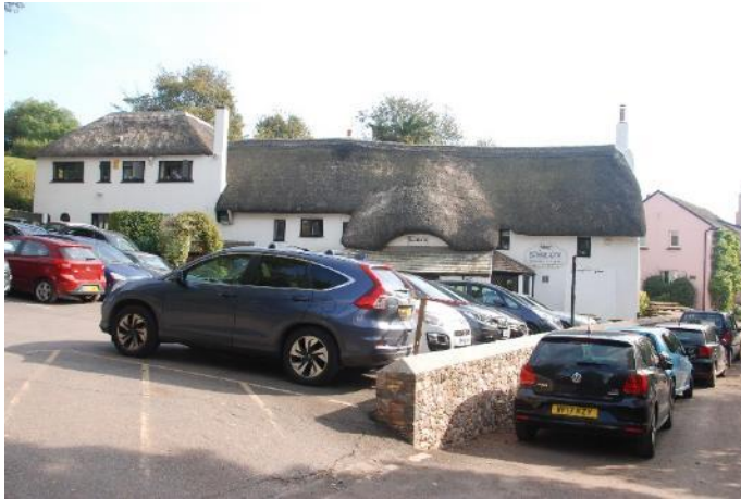
1 The Linny Inn