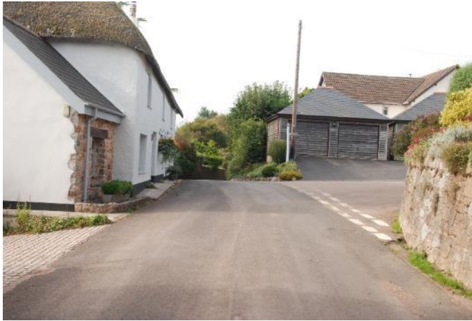
2 Turn right up Connybear Lane