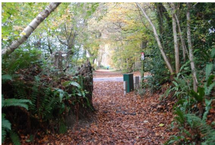
10 Far end of the walk at St Marychurch Road