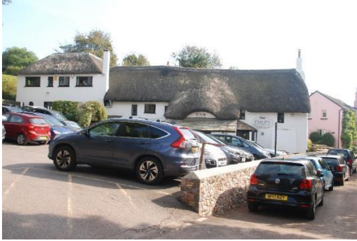
1 The Linny Inn