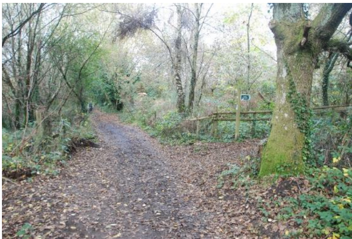
8 Turn right to Footpath 4 (optional extra walk) – skip to photo 9 if you're not doing it