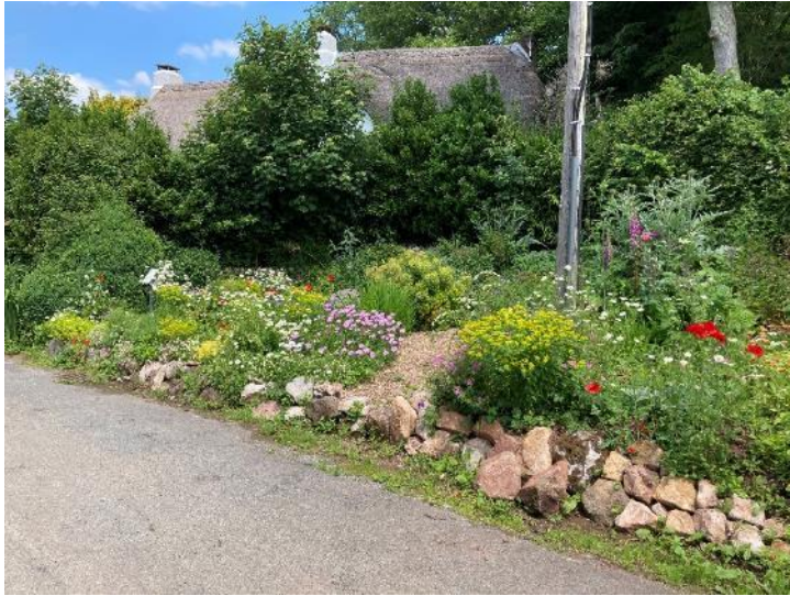
4 The Well