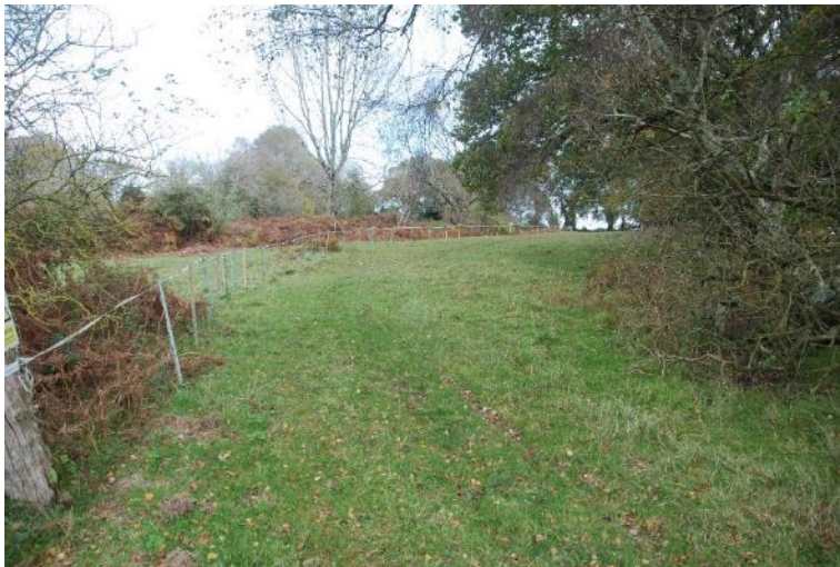
Up the slope to the top