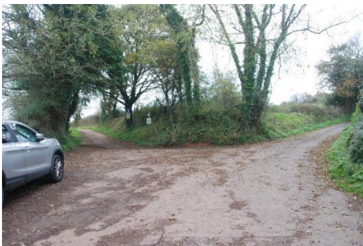
6 Turn left onto Bridleway No 8