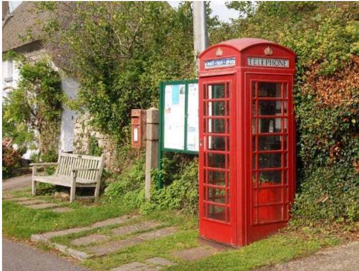
2 Grade II listed phone box