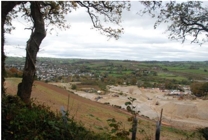
7 Zigzag Quarry