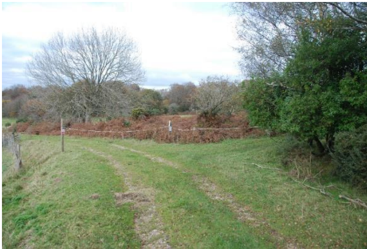
Fork right at the tape