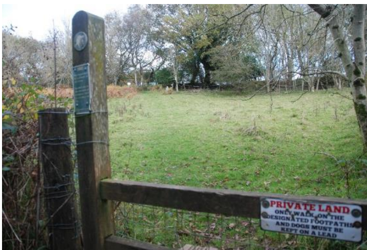
8a Stile leads to grass meadow