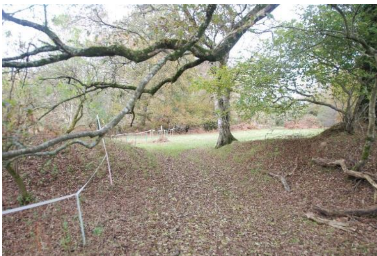
Left at the top towards St Marychurch Road