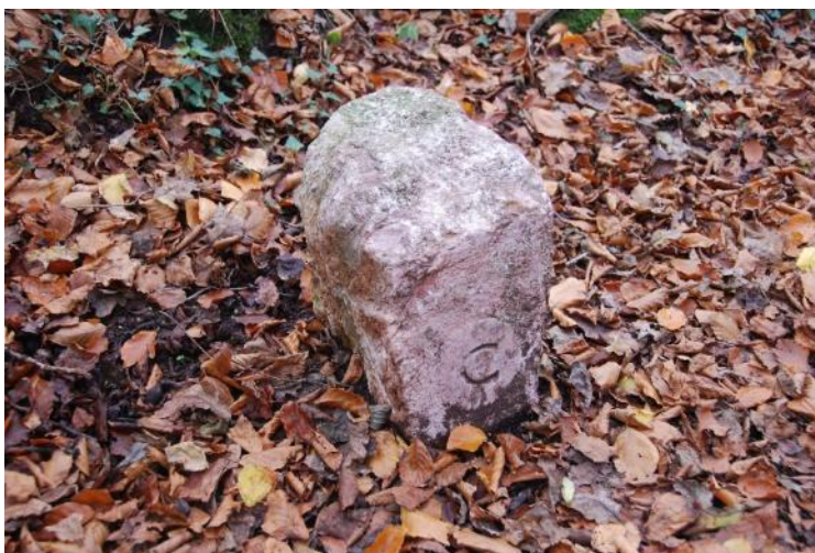
9 Parish boundary stone