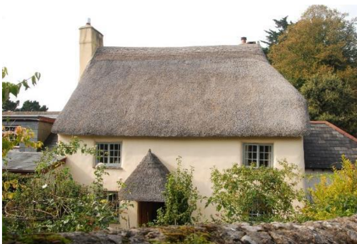
3 The School House