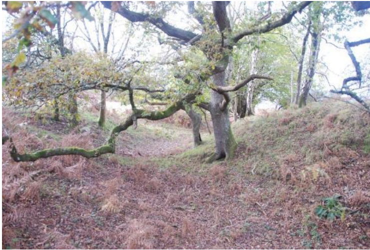
8b The Iron Age Settlement fortifications