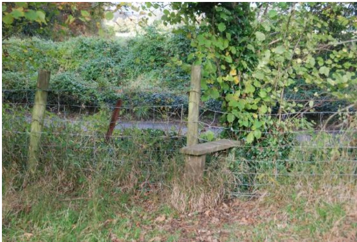
Stile onto St Marychurch Road (not recommended)