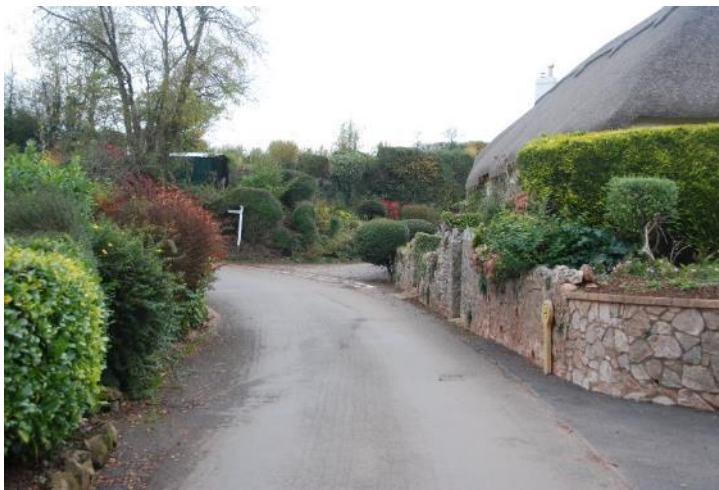
5 Turn right to Blackenway Lane