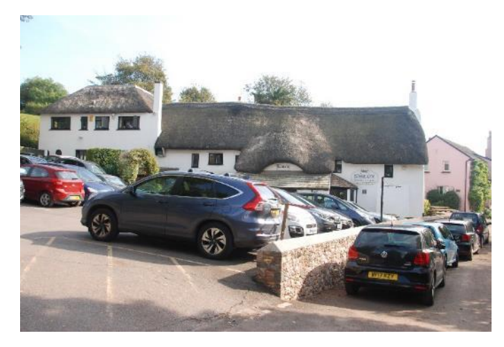
{f 1} The Linny Inn