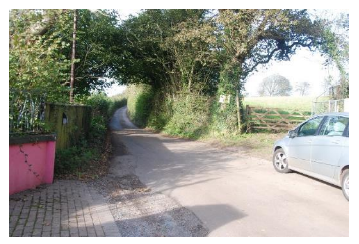
3 Footpath is through gate on the right