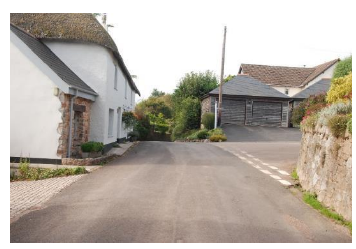
2 Turn right to Connybear Lane