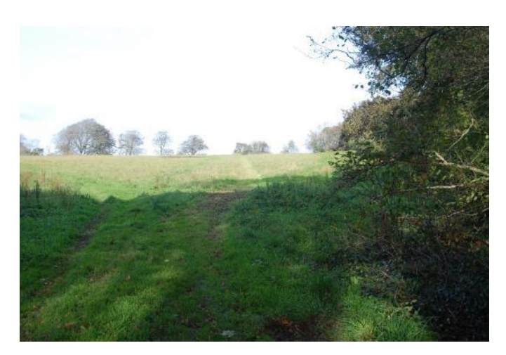
Footpath is roughly parallel to the wood on the right