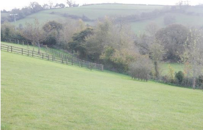
Head for the corner of the wooden fence