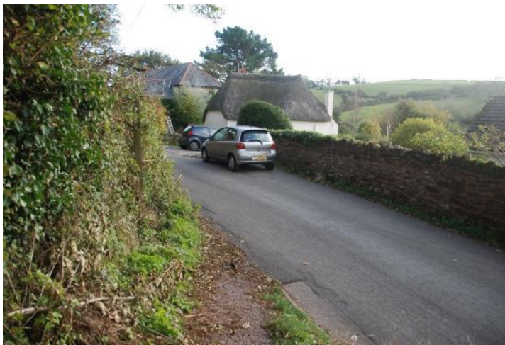
7 Back on the road again