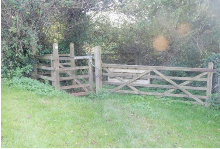
6 Kissing gate at the top of the lane