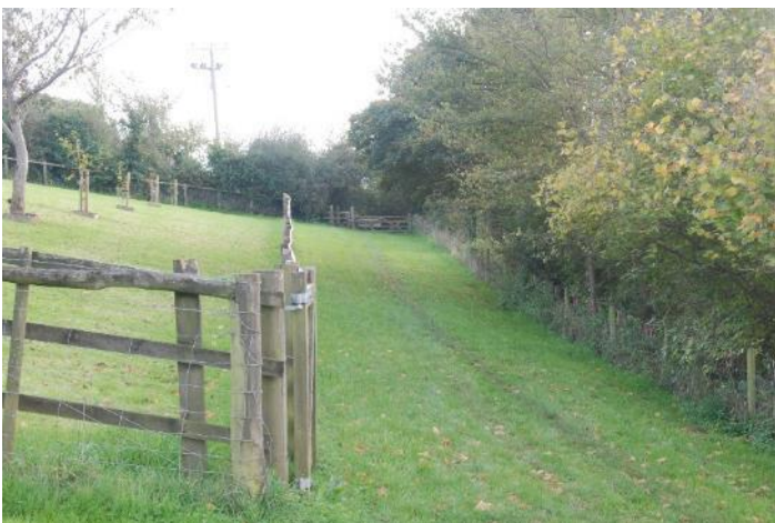
5 Follow the fence to the kissing gate at the end