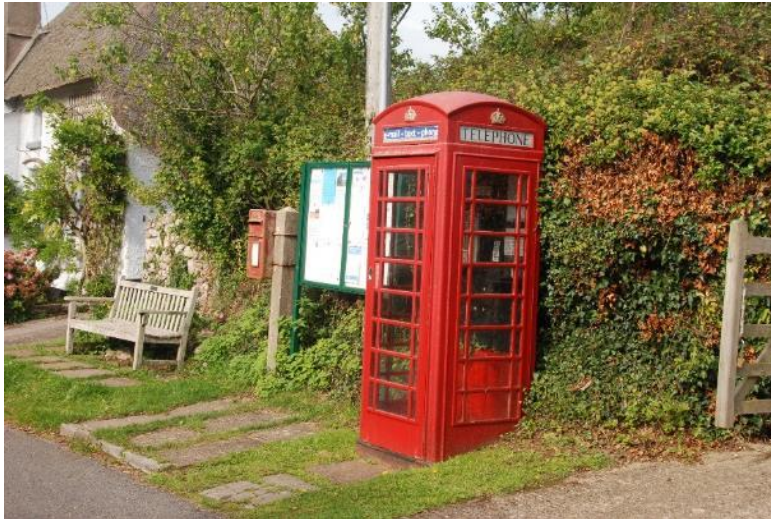
9 Bench and Phone box - Grade II listed!