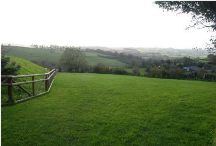
4 The footpath heads roughly to the middle of this picture before bending round to the left