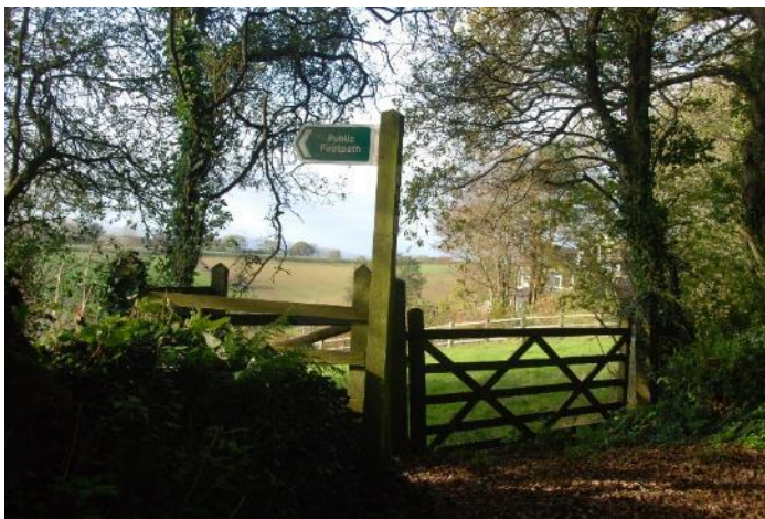
3 Footpath No 2