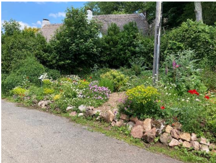
8 The Well area in June