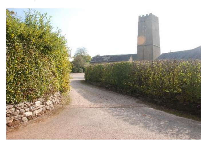
2 Saint Bartholomew's Church