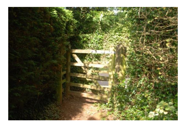
5 The gate at the end of Footpath No 1