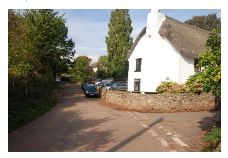
8 Back at The Linny