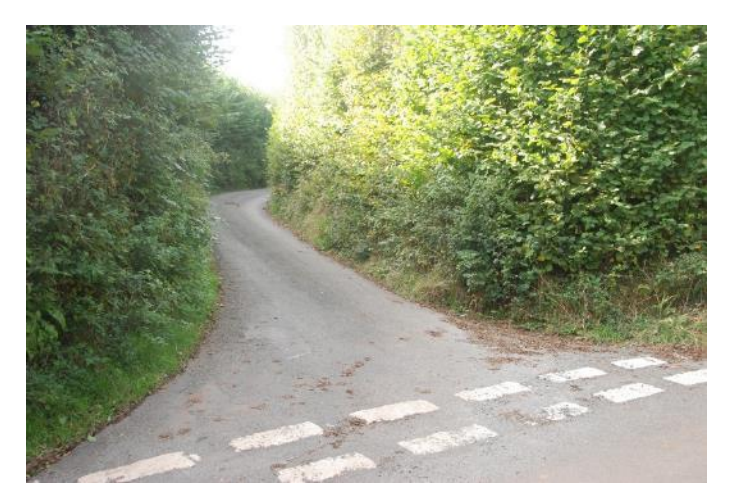
6 Butts Lane