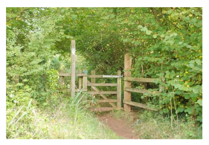
3 No 1 Footpath entrance