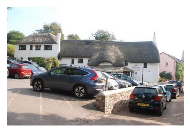
1 The Linny Inn