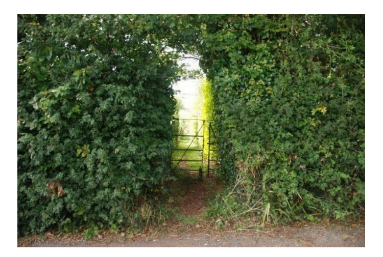
7 The path to the church