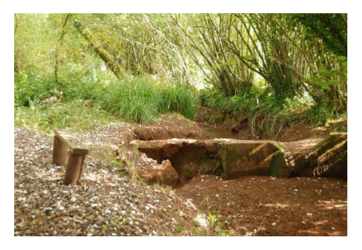
4 The old weir and seat